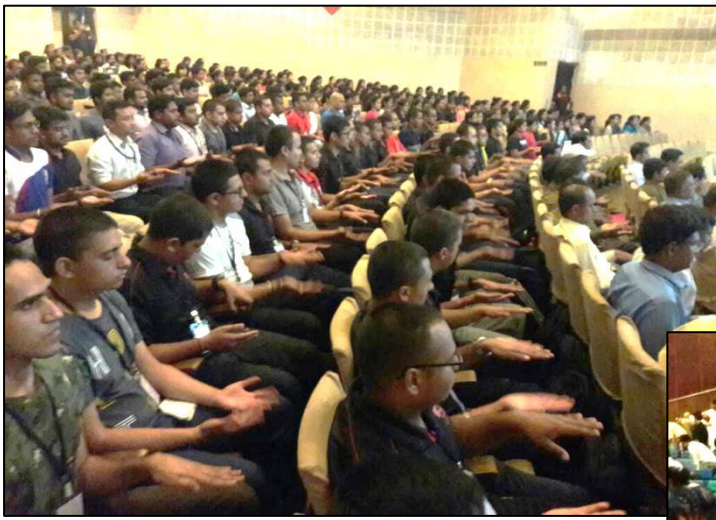
Symbiosis Viman Nagar Campus