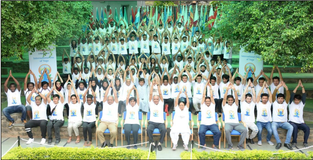
Celebration of International Day of Yoga on 21 st June 2017 with International Students