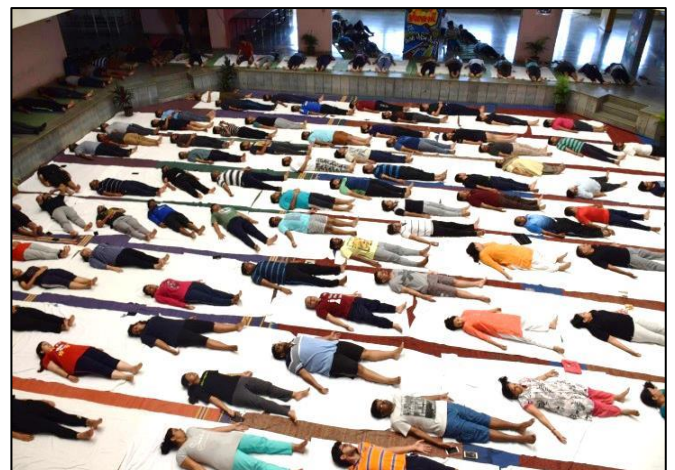
Symbiosis Bangalore Campus