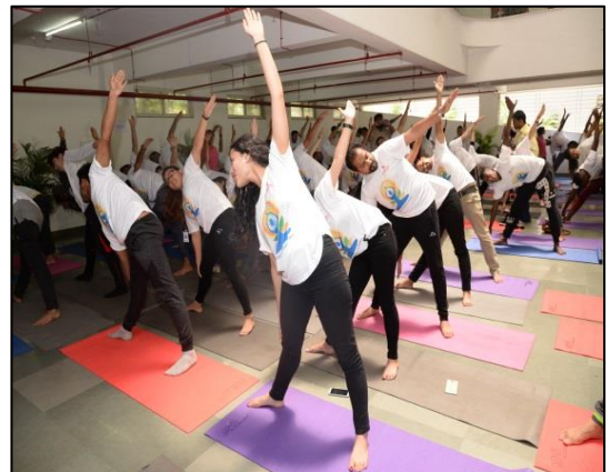
International Students Performing Yoga